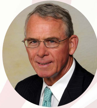
Francis Rooney U.S. Congressman District 19