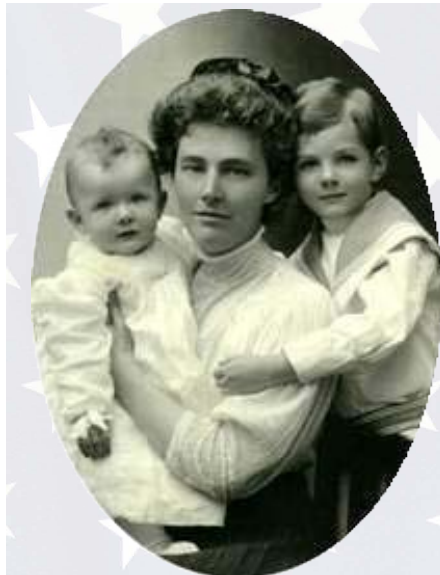
Lou Henry Hoover 1874 - 1944

In 1900, the couple moved to London, England, after Herbert joined Bewick Moreing & Company. Both of their children were born there: Herbert Charles in 1903, and Allan Henry in 1907.