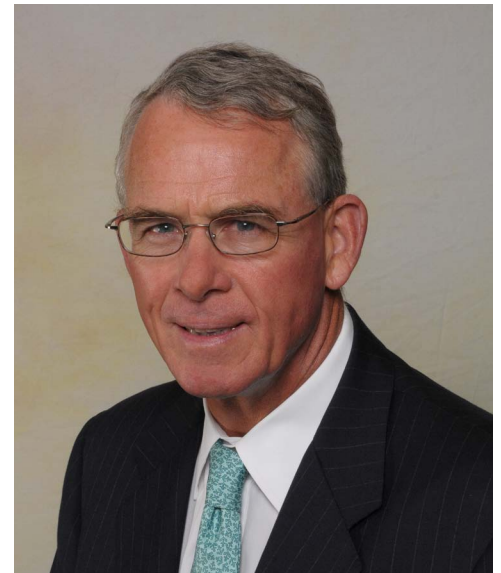
Francis Rooney U.S. House of Representatives