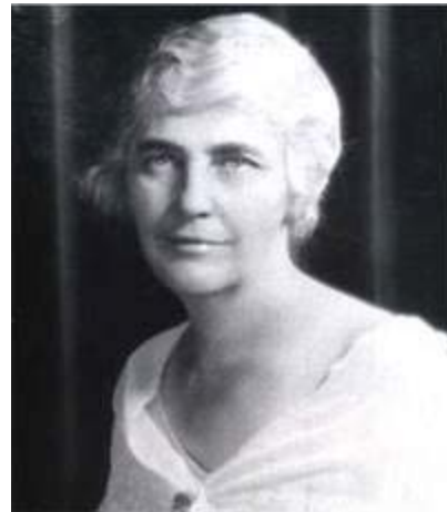
Lou Henry Hoover (with striking white hair)

The Hoovers' oldest son, Herbert Charles served as US Under Secretary of State from 1954 to 1957. Their youngest son, Allan Henry, headed the Hoover Institution at Stanford University for 50 years and directed the establishment of the Hoover Library in Iowa.