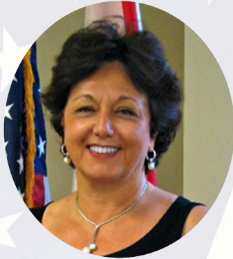
Kathleen Passidomo State Senator